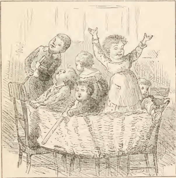
MRS. WILKINS' SIX LIVELY INFANTS.

chairs, and into it marched the birds of the air and the beasts of the field, to judge by the noise, and all set sail, with Washington at the helm, Jackson and Webster plying the clothes and pudding-sticks for oars, while the young ladies rescued their dolls from the flood, and waved their hands to imaginary friends who were not unmindful of the courtesies of life even in the act of drowning.